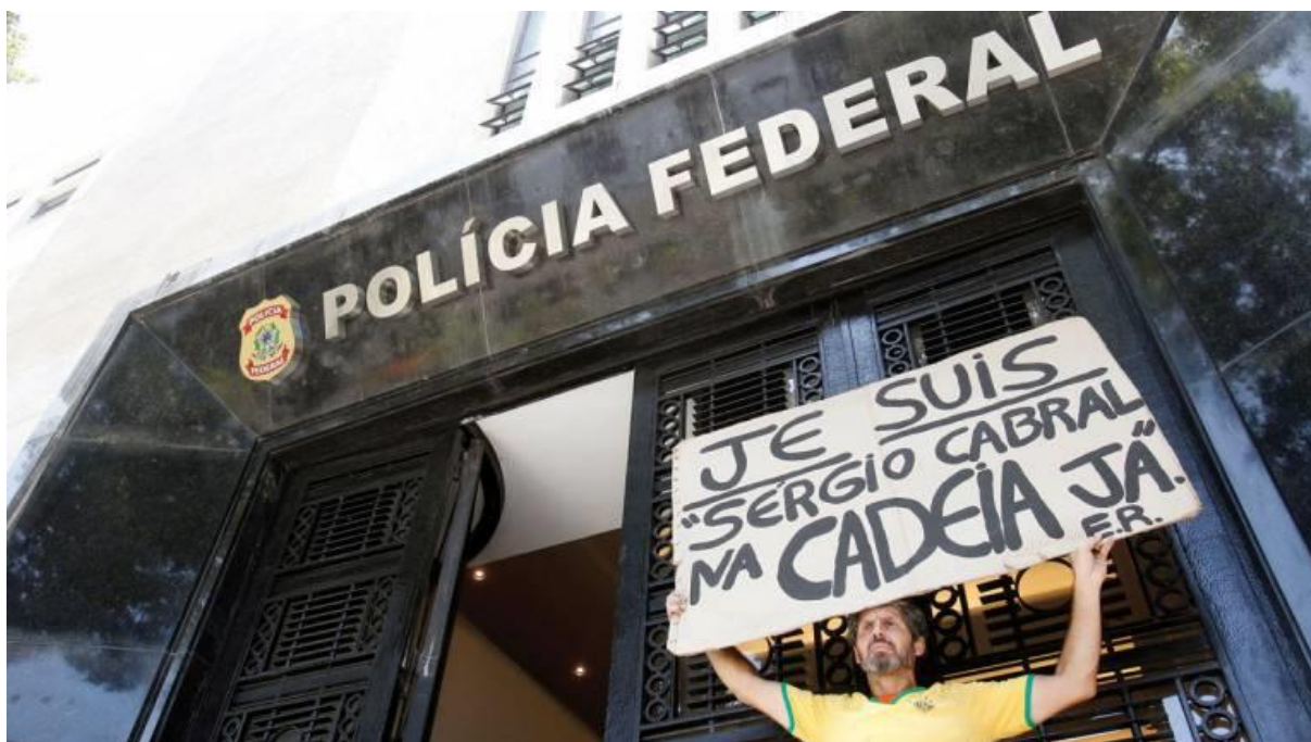
Photography 01 – Protester with poster

The presence of the interdiscourse again can be observed in the report by citing the name given by the Federal Police (FP) to the operation that culminated in the arrest of the former governor, called “Calicute”. Not coincidentally, the same name of the expedition of Pedro Álvares Cabral to India marking the rise and fall of the navigator in the early sixteenth century.